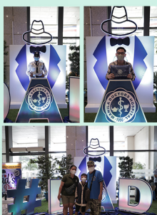
Dads enjoyed the photo booth while showing off their prizes