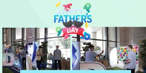
Lining up for a chance to win a prize at the Pop the Balloon game