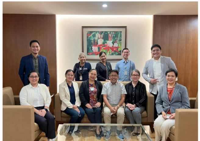
The organizing committee for this year's Mid-Year Conference: