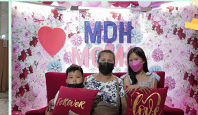
Moms and kids enjoyed taking their snapshots at the photo booth