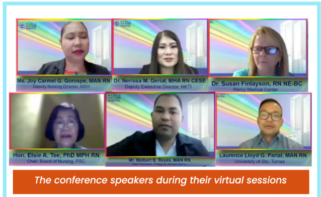
The conference speakers during their virtual sessions

More information will be announced soon so stay tuned!