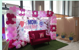
The NTMT II Kalaw lobby was set up to provide a relaxing time for MDH moms

MDH mother-daughter/mother-son frontliners: These moms became role models who inspired their children to follow in their footsteps.