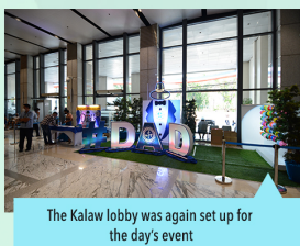
The Kalaw lobby was again set up for the day's event