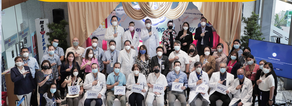
The MDH management and officers gathered to celebrate the launch of MDH's new tagline at the NTMT II Kalaw Lobby.

"With you every step of the way" is MDH's promise and focus in service